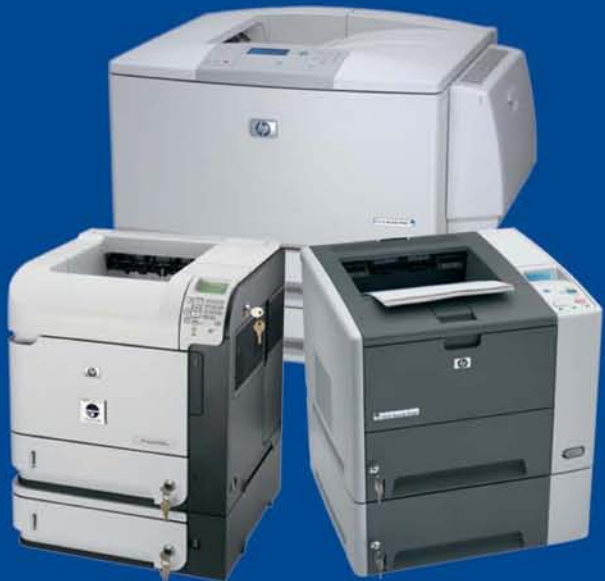
TROY IRD Family of Printers Pictured Above: (Back) TROY IRD 9050d Printer with (2) 500-sheet trays, 1500-sheet tray and printer stand. (Front Right) TROY IRD .3005dt Printer with (2) 500-sheet trays. (Front Left) TROY IRD 4015N Secure EX with (2) 500-sheet trays.