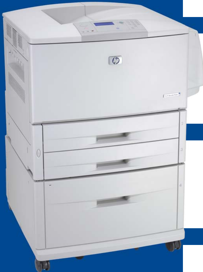
TROY MICR Secure shown with optional 100 sheet multi-purpose tray and 2,000 sheet input tray.