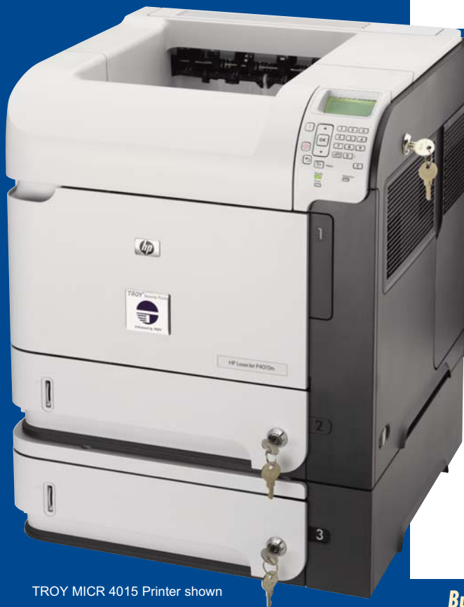
TROY MICR 4015 Printer shown